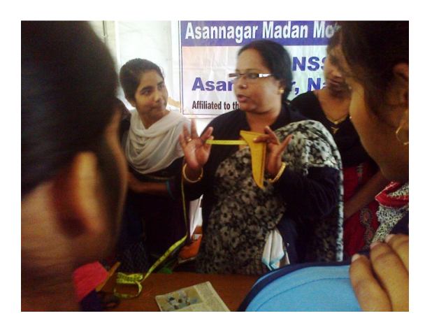
Training of Tailoring