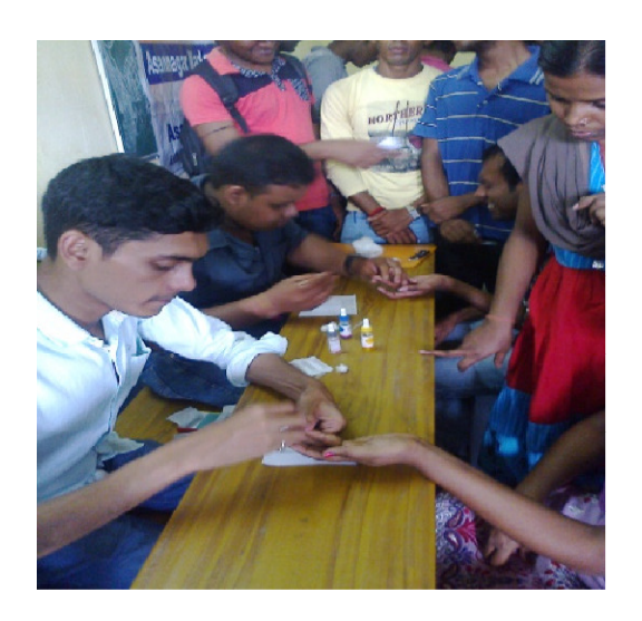
Blood group testing programme