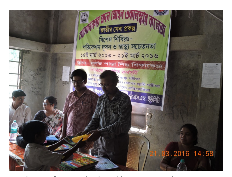
Distribution of exercise books and kits to poor students